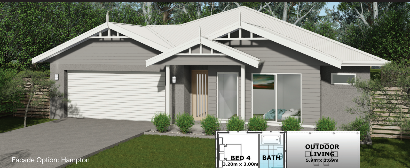
Facade Option: Hampton