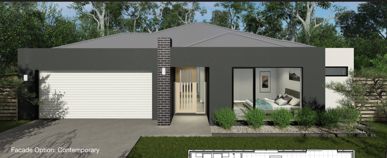
Facade Option: Contemporary