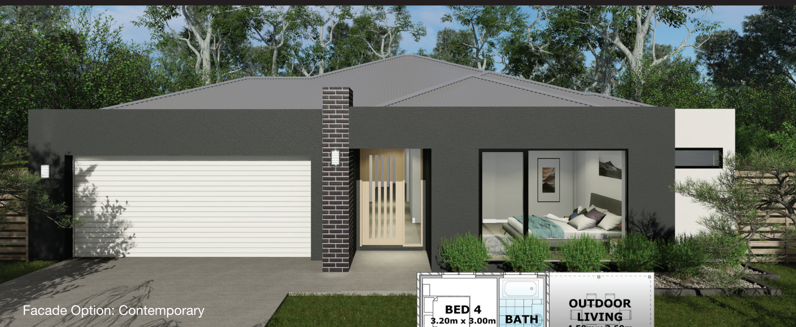
Facade Option: Contemporary