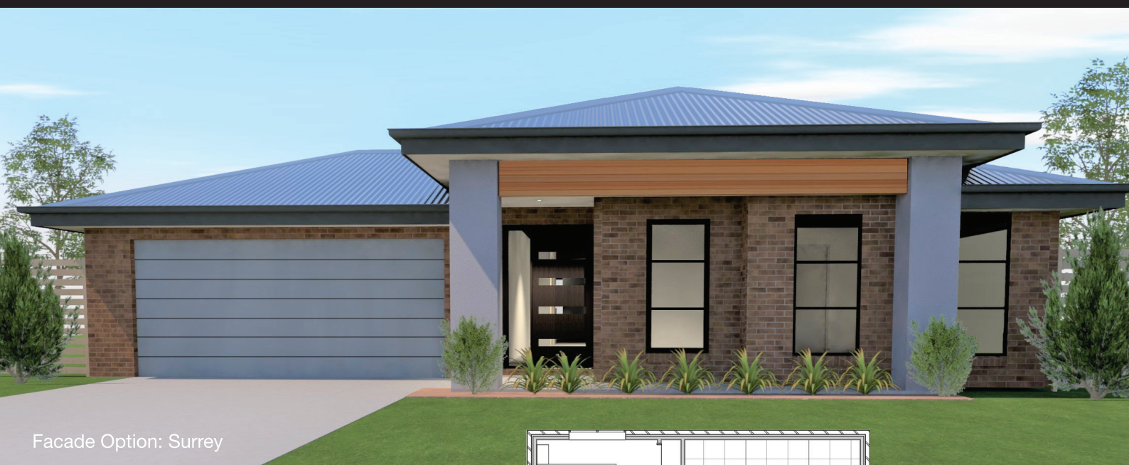
Facade Option: Surrey