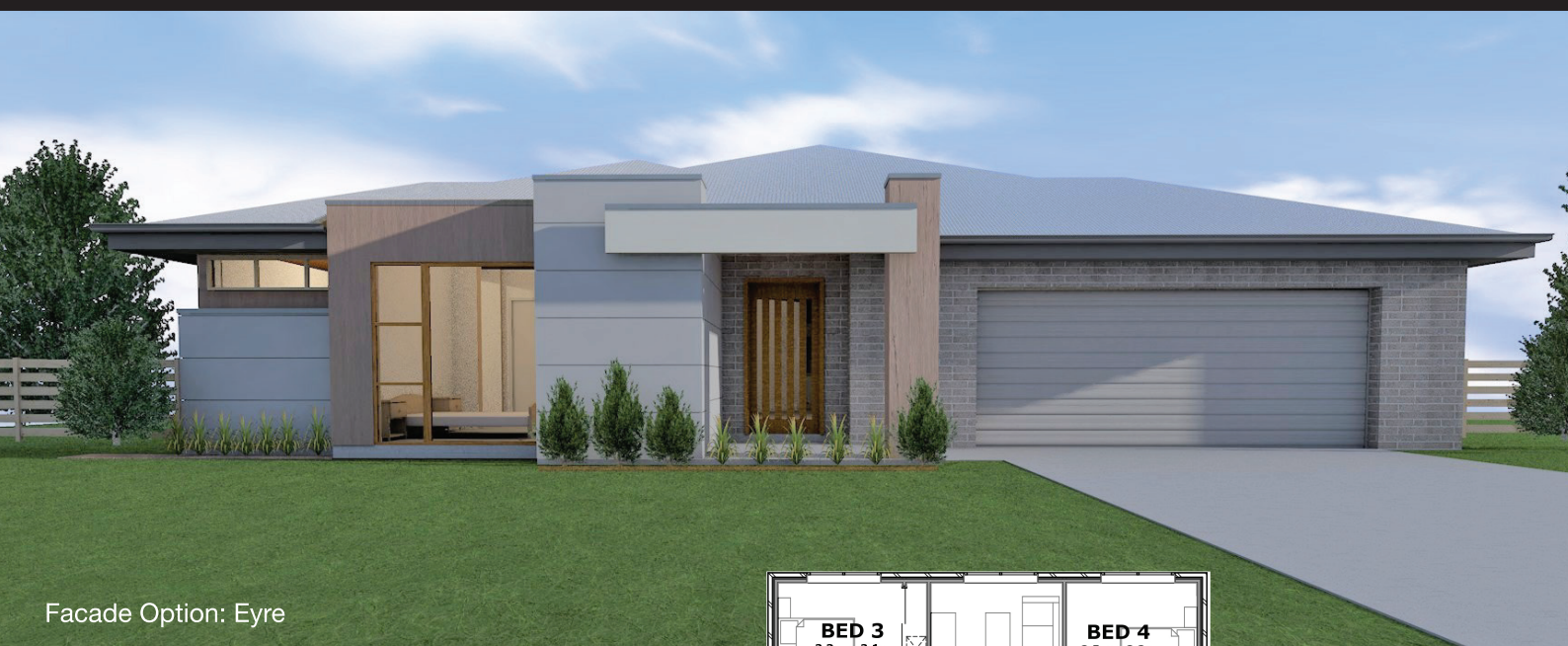
Facade Option: Eyre