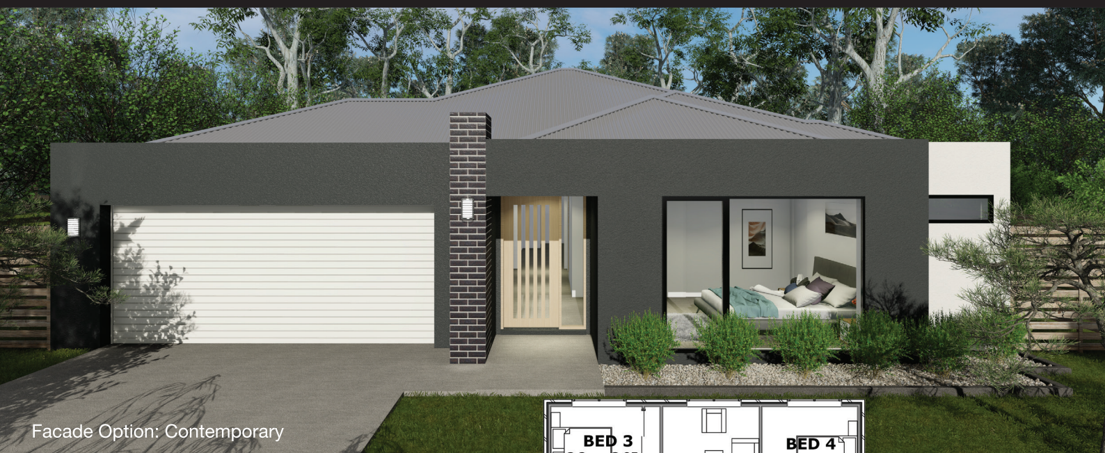
Facade Option: Contemporary