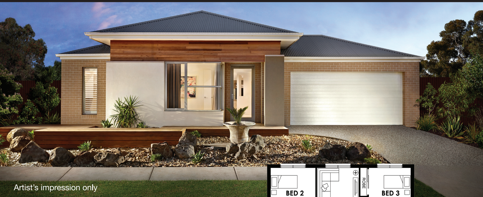
Artist's impression only