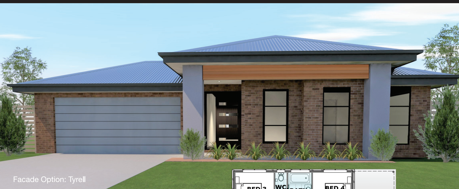
Facade Option: Tyrell